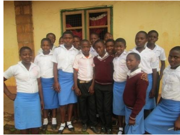
Scholarship Beneficiaries 2016