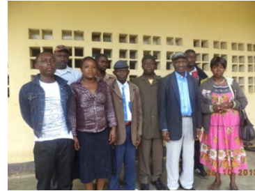
Hired Teachers Beneficiaries 2015

New Programs: We didn't meet our milestone of expanding the sustainable education and assistance program in the area of school renovation. We received funding from a group of private donors to support a new ventures in Agricultural Industry Enhancement Program and After School and Weekend Programs which launched in 2016. The objective is to create both educational and job opportunities for youths from impoverished areas.