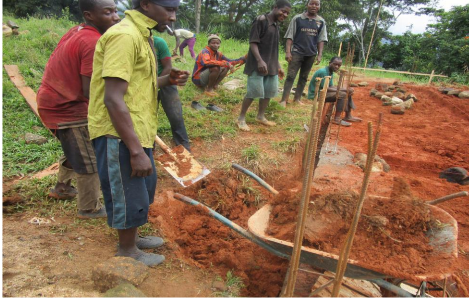
Laying the foundation for Government School Abichia

School Infrastructure Program Government School Abichia