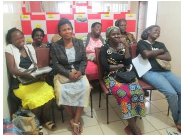
Empowering Market Women 2014

our areas of operations and empowered them to contribute to the development of localities. Due to lack of resources, we targeted specific areas to focus our interventions that will effectively engage community participation to reducing poverty, women empowerment, education promotion, entrepreneurship, economic growth and environmental sustainability.