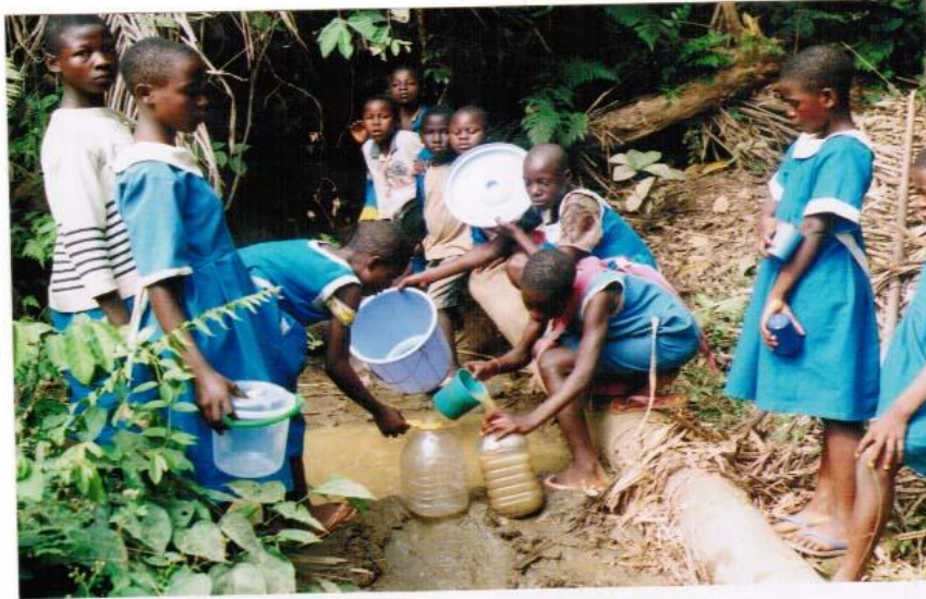
New undertaking- We are committed to providing clean water for the children

We appreciate anyone or organization willing to come onboard to support the ongoing efforts to provide a clean water source to this community.