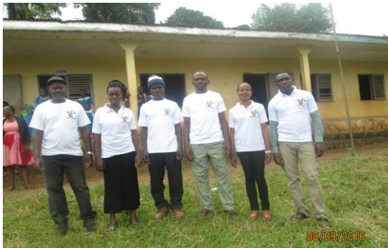
Helping the children of Government School Mbambe

We expand our programs to include Afterschool and Weekend program, this pilot program was launched in Government School Mbambe. We hired a teacher, bought school supplies, textbooks, exercise books and teaching aids. Unfortunately, shortly, after the program started, events on the ground between the Teachers, Lawyers, and Anglophones and the government of Cameroon prevented the smooth running of the program as all institutions of learning were closed and businesses in this region were