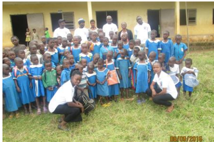
Government School Mbambe

This three-tier program is designed to meet the educational needs of the underprivileged sector of impoverished children and communities.