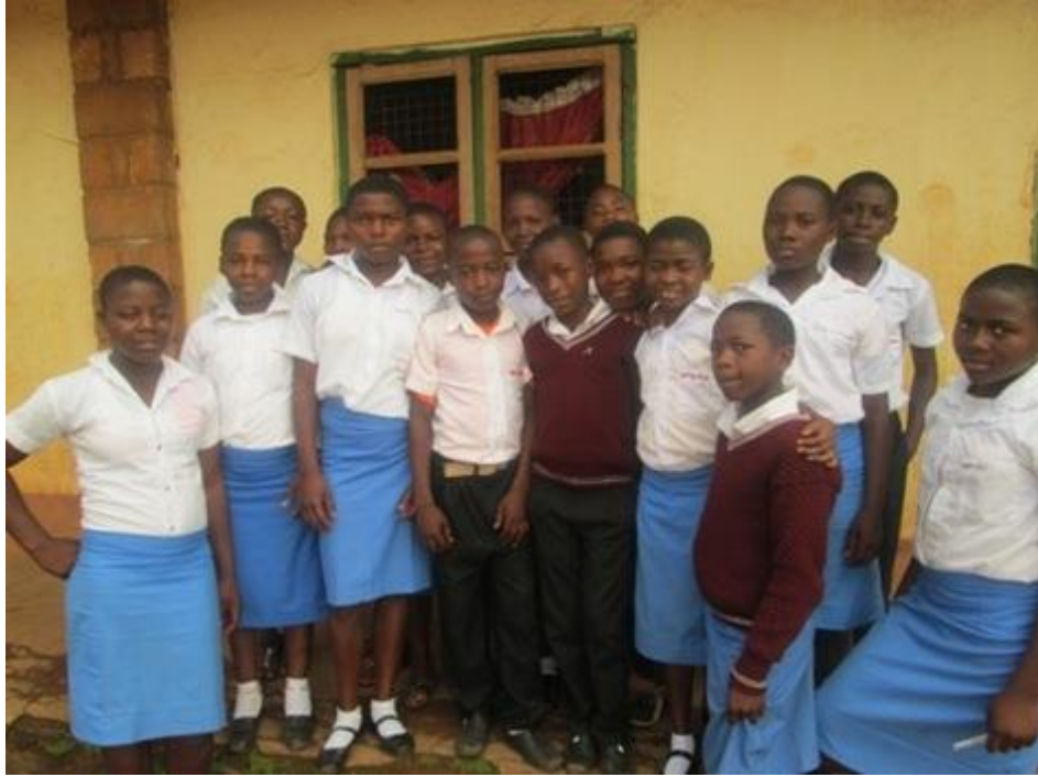
Scholarship Beneficiaries 2016