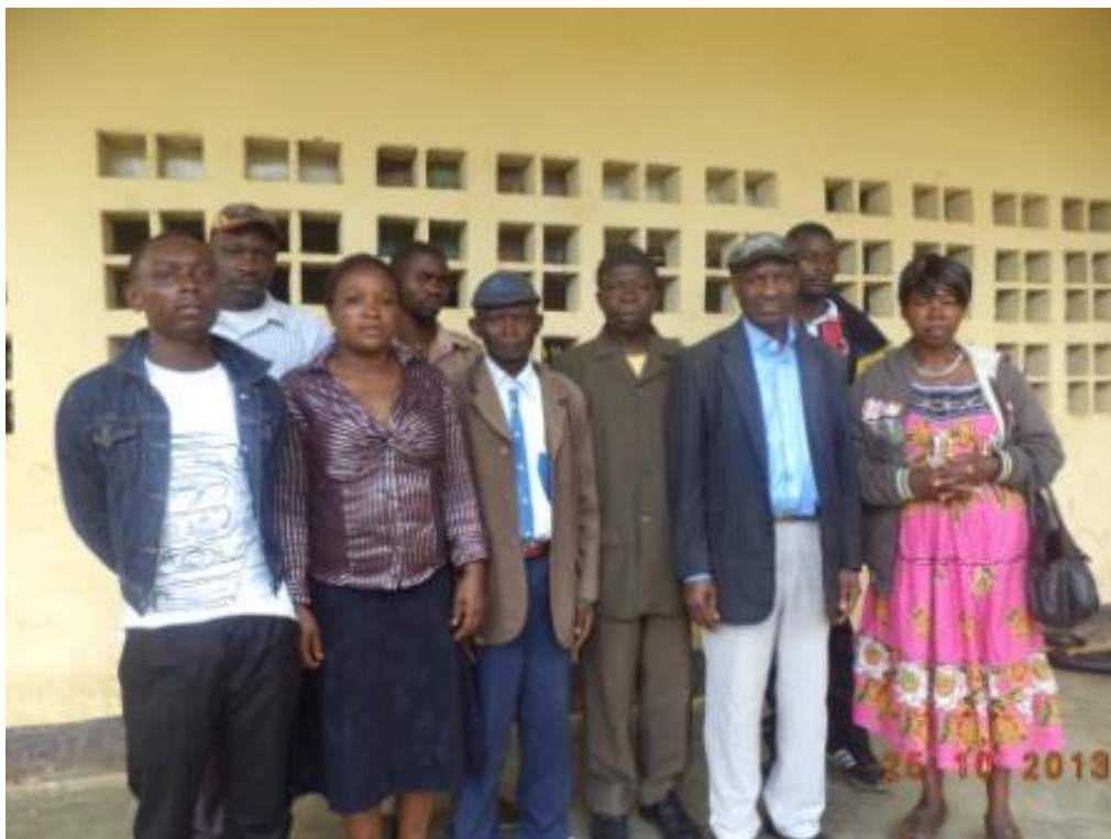
Hired Teachers Beneficiaries 2015