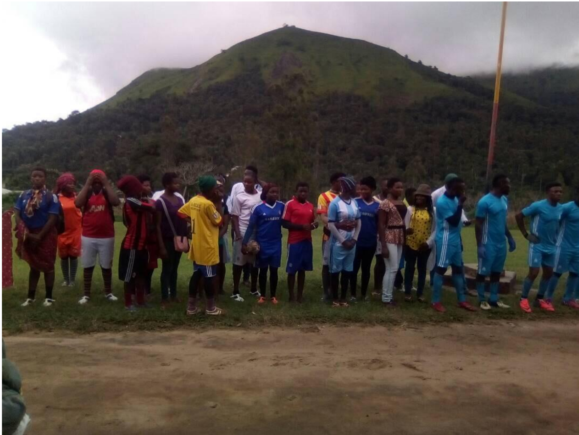
Youths Empowerment Program 2017