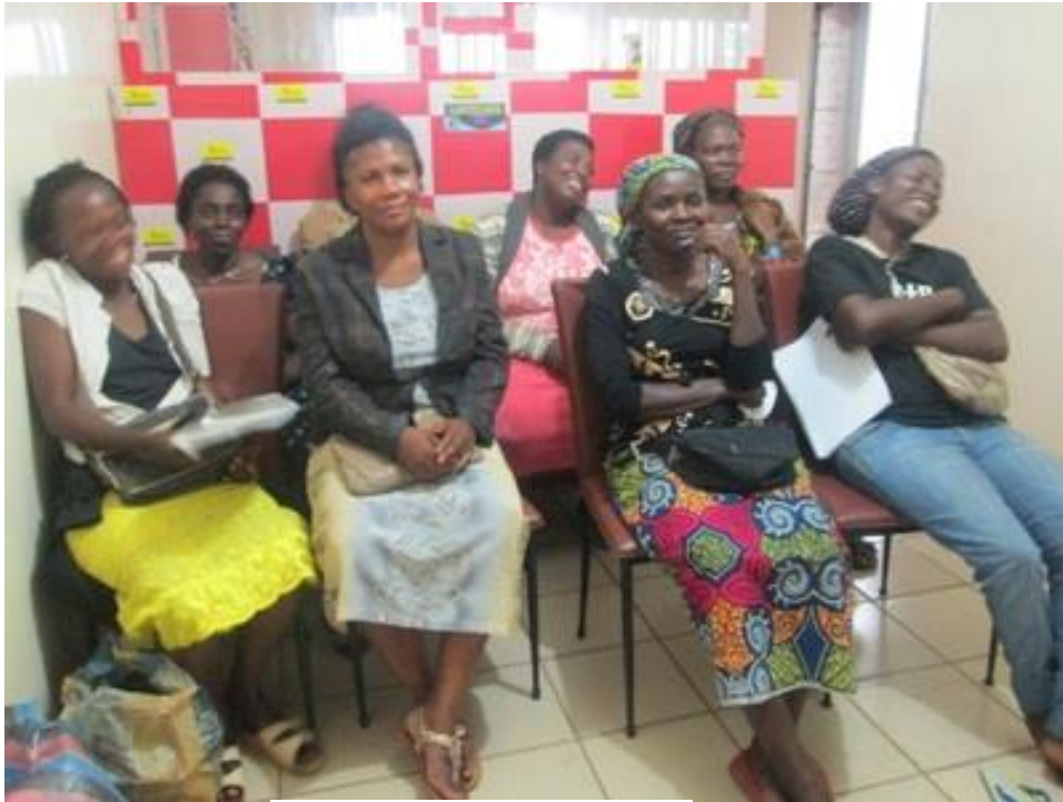
Empowering Market Women 2014